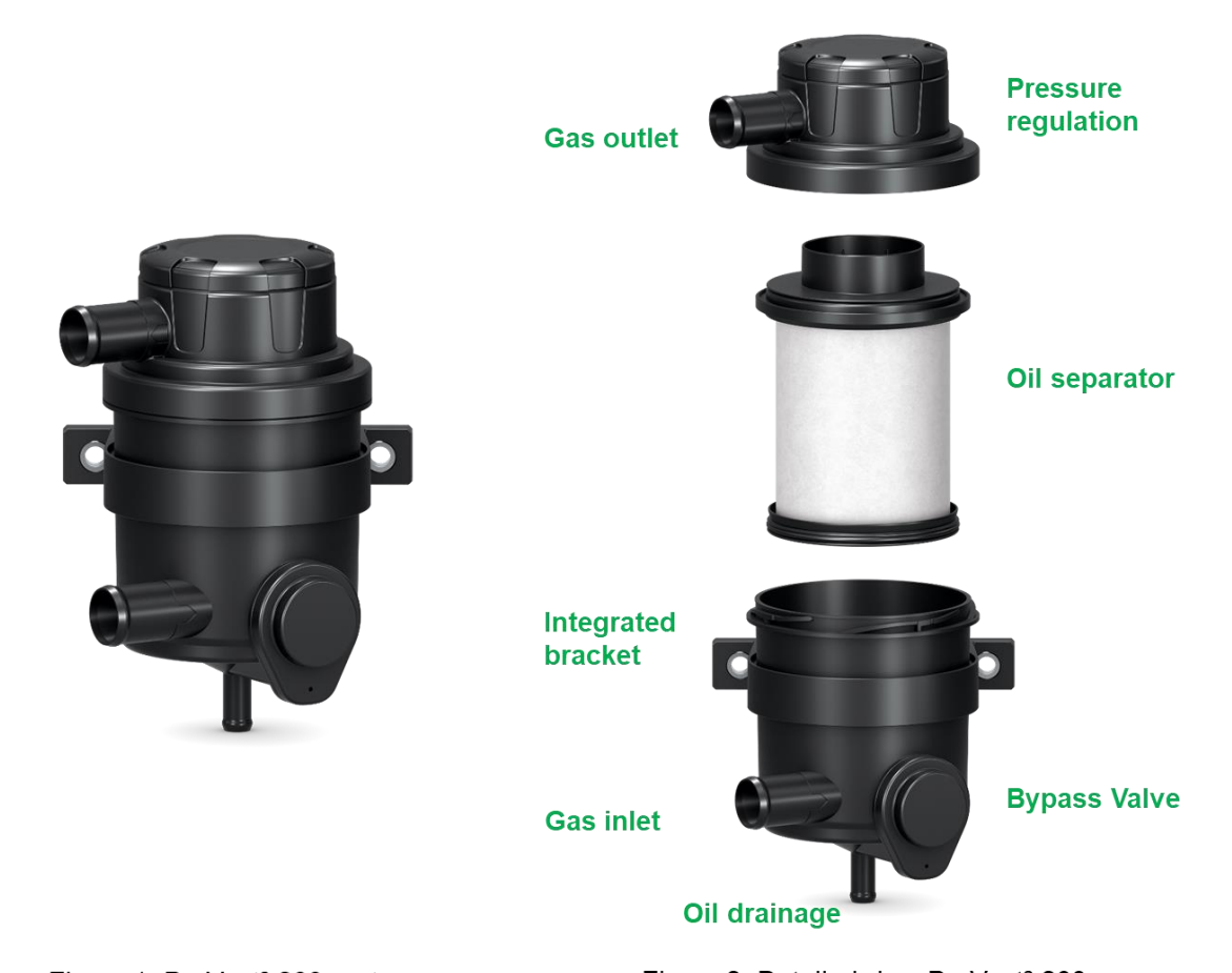
Figure 1: ProVent<sup>2</sup> 200 system

ProVent<sup>2</sup> 200 systems are designed for both original equipment and retrofit. The following illustrations show possible superstructures and a cross-section of the system.