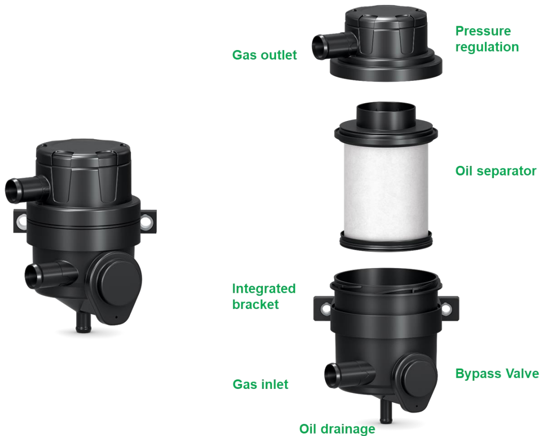
Figure 1: ProVent 2 100 system

ProVent 2 100 systems are designed for both original equipment and retrofit. The following illustrations show possible superstructures and a cross-section of the system.