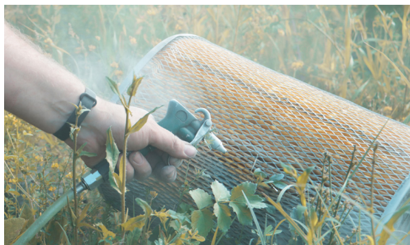
Example of incorrect manual cleaning