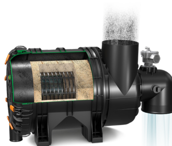
Dust loading Filter works as classical 2-stage air cleaner