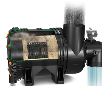
Scavenge operation extraction of separated dust resumption of dust loading