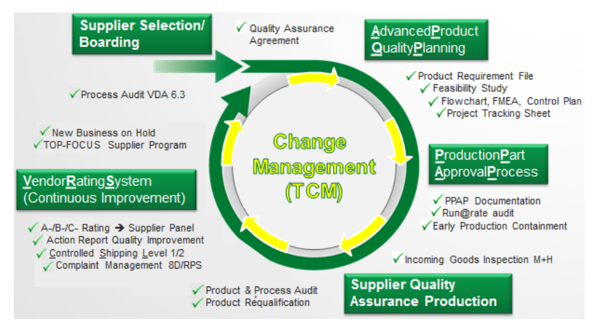
Diagram "Supplier Quality Lifecycle"

MANN+HUMMEL to manage supplier quality. Starting with the supplier selection, followed by the Advanced Product Quality Planning (e.g., APQP) and the Production Part Approval Process (e.g., PPAP), we are regularly monitoring parts' quality and the quality and delivery performance of our supply base during series production.