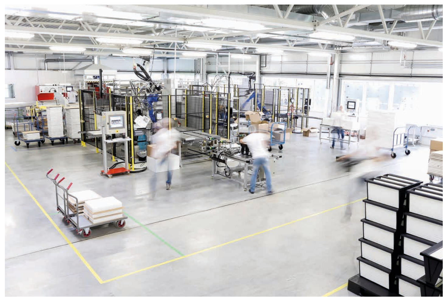
Filter production at the MANN+HUMMEL plant in Steindorf/A