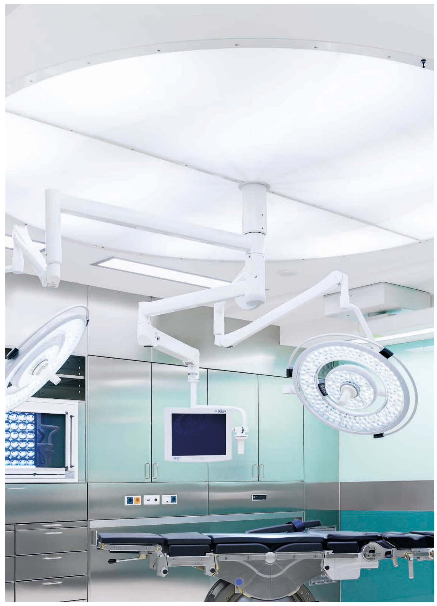
TAV ceiling system Optima CG-P/Optima CG-N