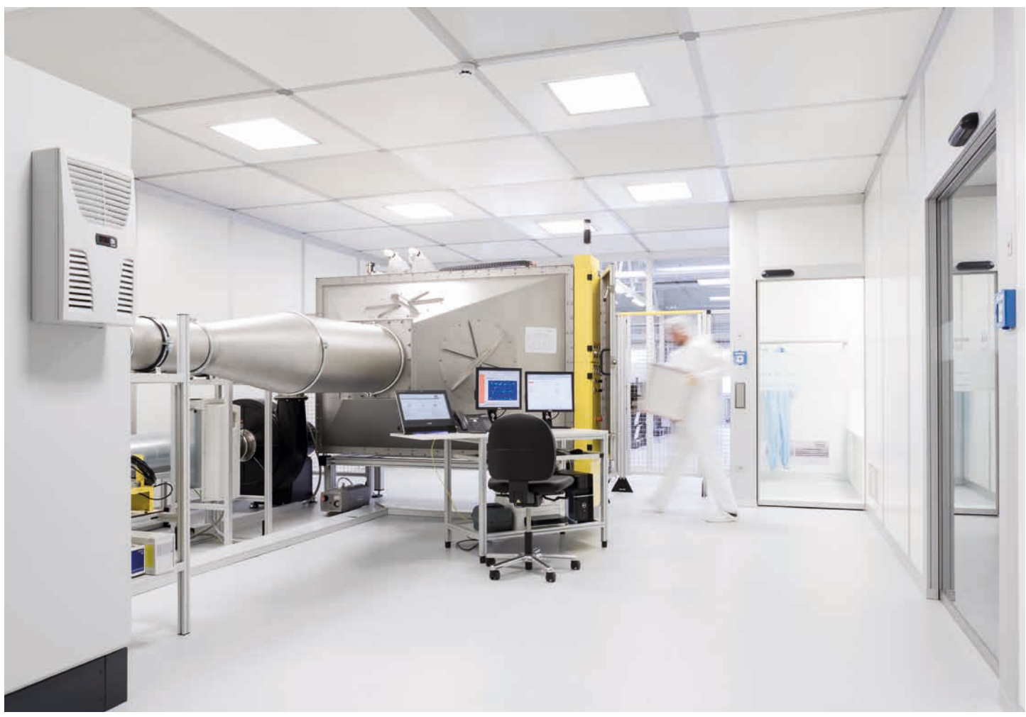
Scan test facility at the MANN+HUMMEL plant in Steindorf/A