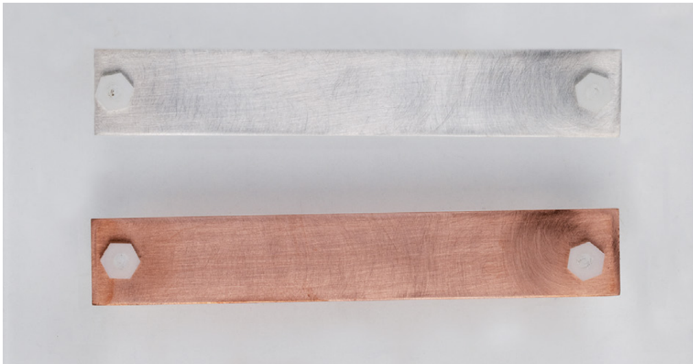
▲ Silver and copper foil coupons used for coulometric reduction analyses

For a full picture of the air quality in your datacenter, MANN+HUMMEL can conduct a survey of your facility. We will measure the external and internal contaminant levels, and provide you with a full report, including a recommended filter configuration for your specific environment. Please contact us for more information.