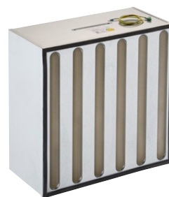
AIRCUBE/NANOCCLASS CUBE N PRO ATEX