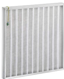
AIRCURVE PRO ATEX

Our ISO 16890 products are also independently tested by the Eurovent trade association to validate their filtration efficiency, pressure drop and energy consumption performance.