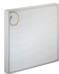
AIRSQUARE/NANOCCLASS SQUARE PRO ATEX