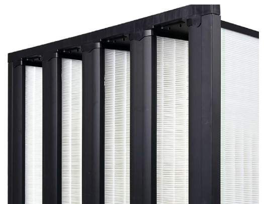
Robust, fully incinerable, hollow profile, plastic frame, made from recyclable materials

The VB4 XL 17 Ultra filters are available in single header and utilize aerodynamic vertical supports, constructed from high impact polystyrene (HIPS) plastic, to reduce air entrance turbulence. The top and bottom of the frame are also made from HIPS to enhance rigidity.