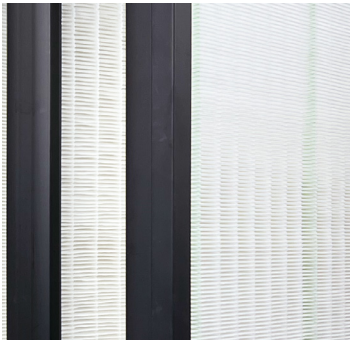
VB4 17 Ultra pleated cells with hot melt separators

The MANN+HUMMEL VB4 XL 17 Ultra V-Bank filter is an extended surface filter featuring synthetic media designed for applications that benefit from low operating pressure drop, high dust holding and long service life. The VB4 17 Ultra has 230 sq ft of synthetic media in a 24x24x17 filter.