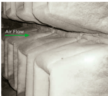
Tri-Dek® RFX filters installed