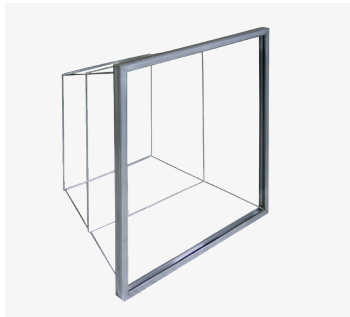
Tri-Dek® RFX frame