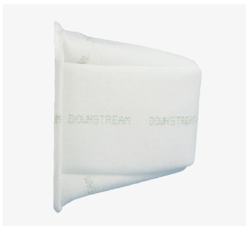
Trapezoid shape allows for maximum performance