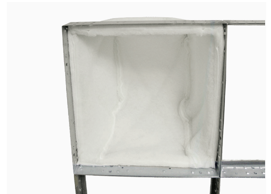
The Tri-Dek® 3/67 offers self gasketing which eliminates the bypass of unfiltered air

The Tri-Dek® 3/67 can be easily retrofitted into most applications allowing for an easy upgrade from traditional prefilters.