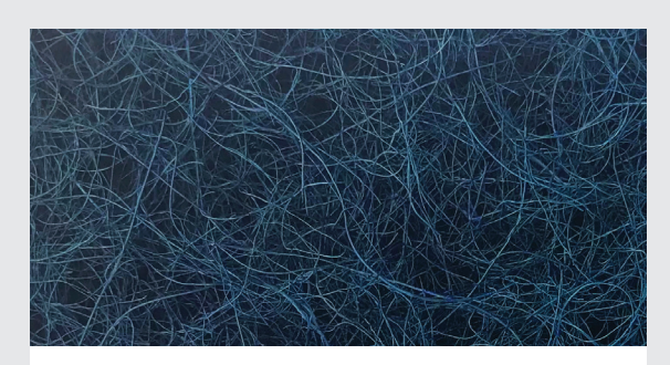
Media Front Closeup