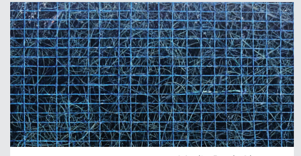
Media Back Closeup