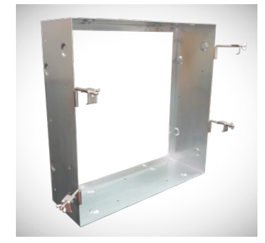
Tri-Lock HF<sup>™</sup> with swing arms