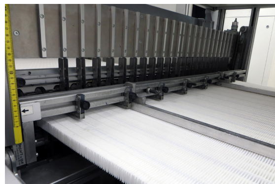
MANN+HUMMEL Air Filtration Americas Cleanroom production area