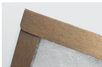
Close-up of channel frame

MANN+HUMMEL's SelectF air filters are cost-effective and efficient disposable panel filters. These filters were created specifically for commercial and industrial applications requiring a light-medium workload. The SelectF features a durable construction Kraft board channel frame. These easy-to-install filters are environmentally friendly and made in the USA.