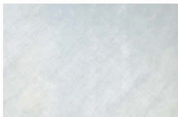
Close-up of fiberglass media